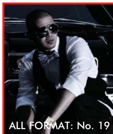
ALL-FORMAT: No. 19