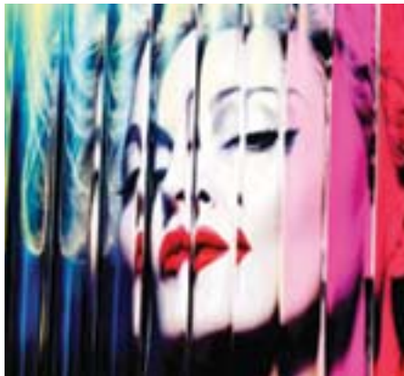
In its second week of release, Madonna's "Give Me All Your Lovin'" jumps to the top of the Billboard Canadian Hot 100, her second chart-topper.

Albums chart at No. 24 with 2,000 copies sold.