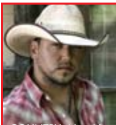
COUNTRY: No. 46