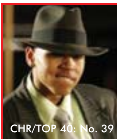
CHR/TOP 40: No. 39